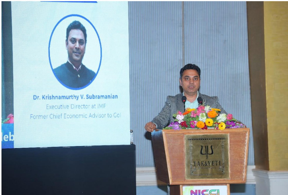
Dr. Krishnamurthy V. Subramanian Executive Director at IMF and Former Chief Economic Advisor to the Government of India.

merchant establishments in Nepal.” Regarding this he cited that in today’s time more than 1,000 transactions were carried out by Indian tourists visiting Nepal.