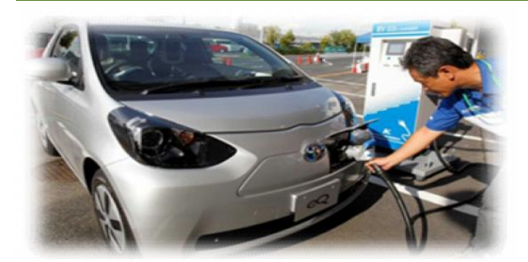
A participant to a press event by Toyota Motor Corp. puts a quick charger plug into the newly-developed compact electric vehicle "eQ" during a test drive at a press event in Tokyo Monday, Sept. 24, 2012.

The company will launch an all-new Alto 800 next month to replace the existing Alto as the company seeks to overcome tough market conditions, especially high petrol price and interest rates that have hurt the sales of small cars.