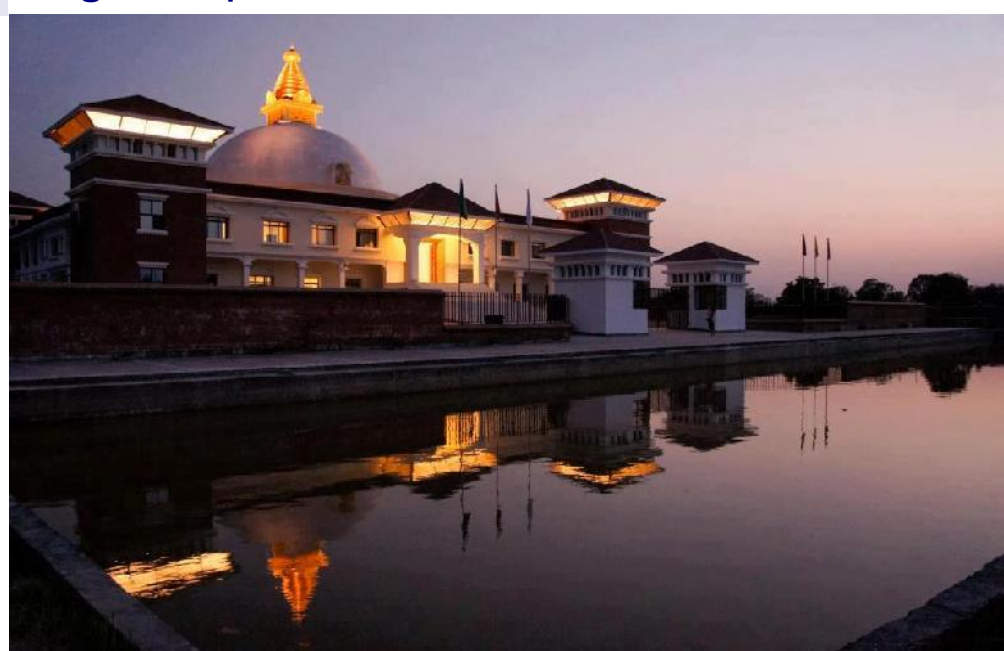
Lumbini - the world's centre for peace